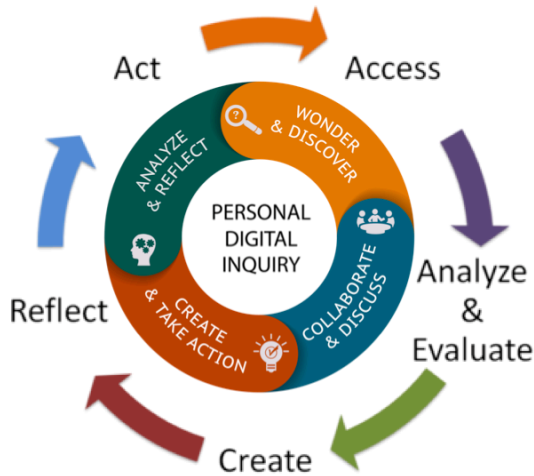
Figure 2 Personal Digital Inquiry for Digital and Media Literacy (PDI-DML)