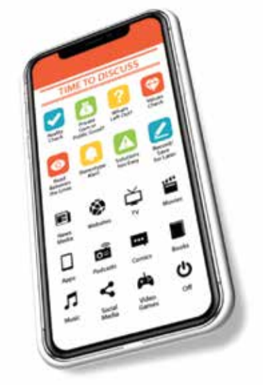
FIGURE 1: MEDIA LITERACY SMARTPHONE

Because these questions stimulate discussion about representation, economics, values, and power, the discussion of the video touched on issues of depictions of fairness and justice. Analysis activities like these examples can help people appreciate how all sorts of different media may affect their understanding and perceptions of social reality, which in turn shapes possibilities for their own lives. This critical stance toward media messages also encourages people to examine their own positions in society and their social responsibilities as consumers and creators of media messages.